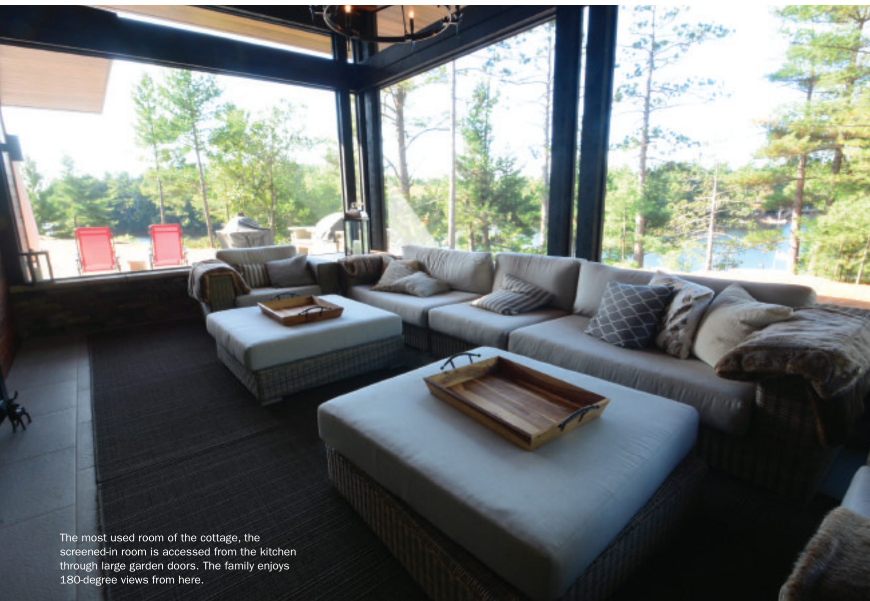
The most used room of the cottage, the screened-in room is accessed from the kitchen through large garden doors. The family enjoys 180-degree views from here.

This ultra-modern cottage truly does offer a traditional cottage experience.