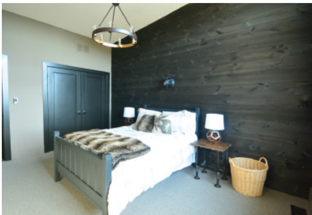
All of the bedrooms are spacious with large windows and a feature wall.

This ultra-modern cottage truly does offer a traditional cottage experience.